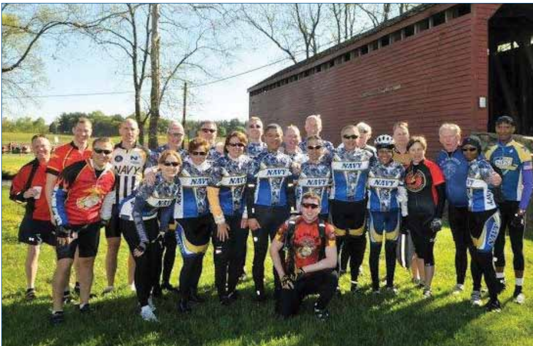
Face of America Bike Ride participants pause for a photo at Loys Station outside of Gettysburg, Pa.